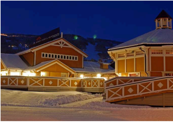
The Scandic Lillehammer Hotel.

All athletes and coaches will stay at the official World Cup Hotel, Hafjell Hotel, conveniently located a couple of minutes by bus to Hafjell Resort.