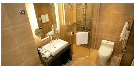
Holiday Inn Resort