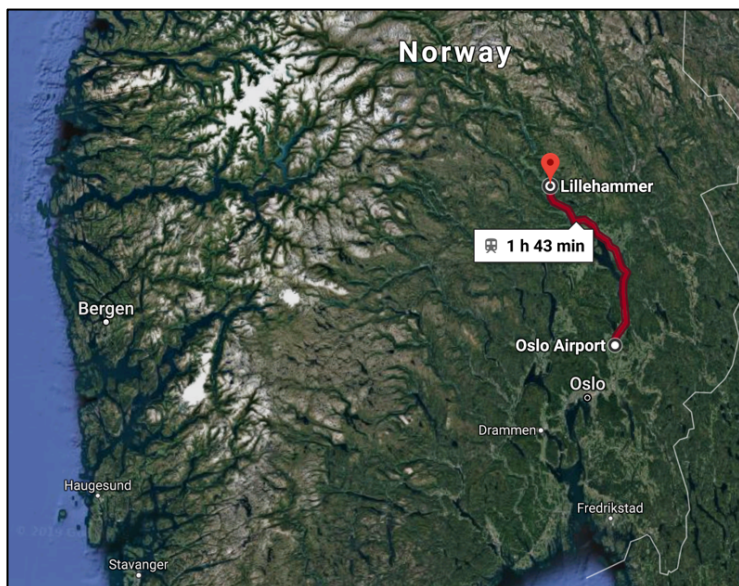
Travel times by train from OSL to Lillehammer is only 1 h 43 min.

All visitors to Norway will need a valid passport. A Visa is necessary for some countries. If a Visa is required, teams are responsible to arrange Visas in a timely manner for all accredited team members. Everyone who requires a Visa must have this before boarding the plane or crossing the border into Norway. Please let us know if you have any questions at paraworlds2021@skiforbundet.no .