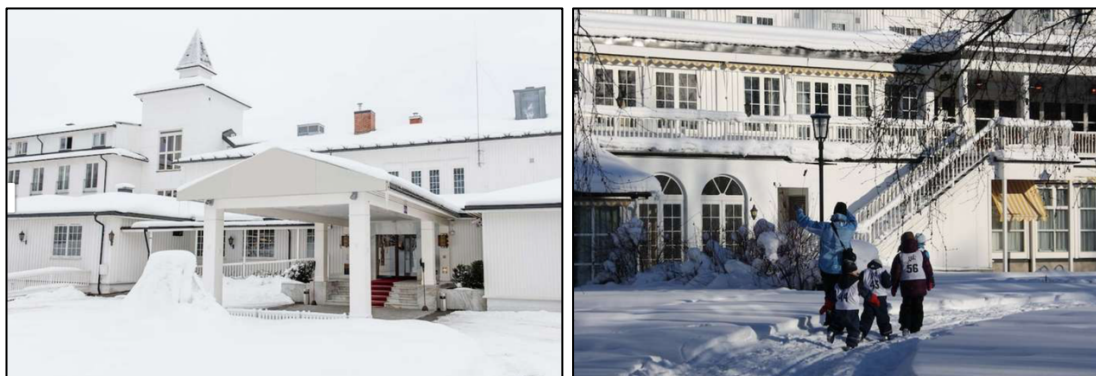
The Scandic Lillehammer Hotel.

If you have any question regarding transport or accommodation, please contact us at paranordic@gyro.no .