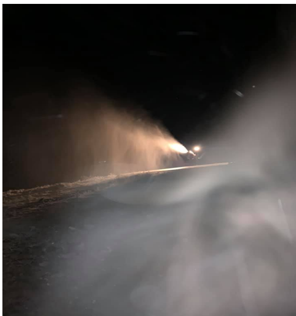
Birkebeineren Ski Stadium, November 1 st 2019.

As you can see in this picture from today, snow production has started at the Birkebeineren Ski Stadium.