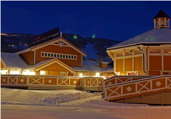
The Scandic Lillehammer Hotel.

All athletes and coaches will stay at the official World Cup Hotel, Hafjell Hotel, conveniently located a couple of minutes by bus to Hafjell Resort.